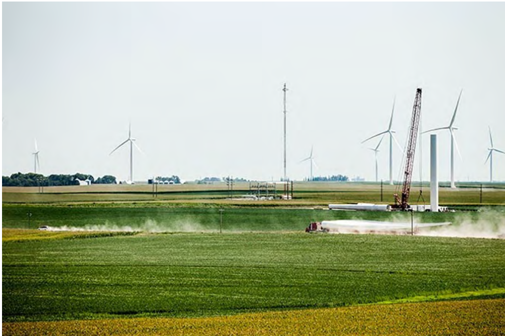
■ Left: Construction of Highland Wind Farm