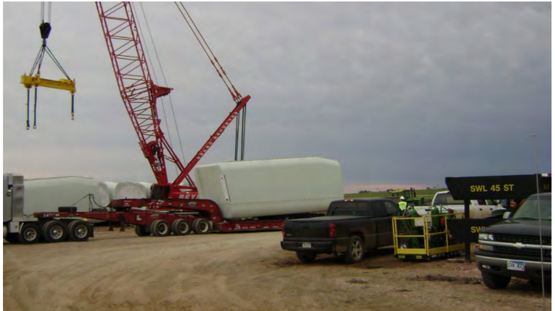
■ Construction crews work on turbine construction for the Buffalo Ridge Wind Farm in Deuel and Brookings counties. South Dakota will soon be home to hundreds more wind towers across the state.

being brought online generating 95 MW. The farm produces enough electricity to power approximately 25,000 homes for a year. With 700 homes in Campbell County, all of the electricity generated by the turbines runs through Basin Electric Power Cooperative. More is yet to come as Con Ed Development will soon begin phase two of the project to construct an additional 38 turbines, which are even more efficient with the advancements in technology.