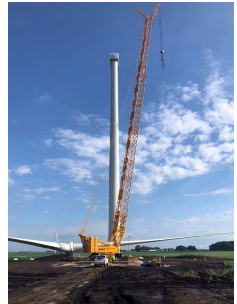
■ Above: Glaciers Edge Wind Farm