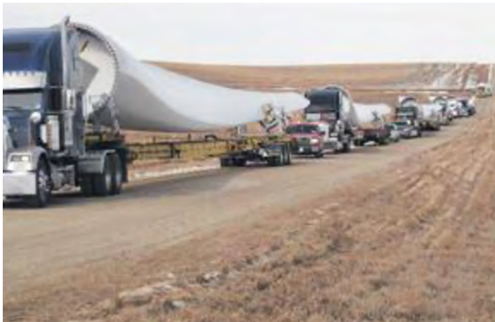
■ Campbell County South Dakota.

There is no shortage of wind in Campbell County South Dakota and with it comes great opportunity. In December 2015, the Campbell County Wind Farm was completed with 55 turbines