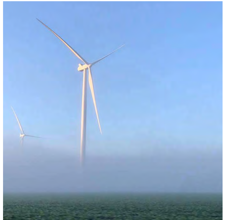
■ Randolph County, Indiana

Benton County is an excellent example of the benefits of wind energy. Their wind farms have not only generated tens of millions of dollars for improving the county, but also help in the small steps